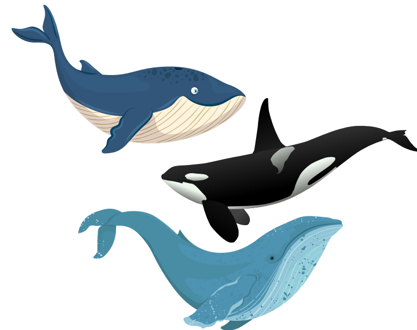
A POD OF WHALES