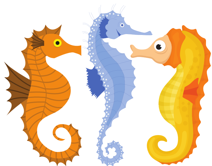
A HERD OF SEAHORSES