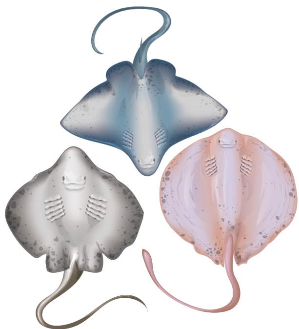
A FEVER OF STINGRAYS