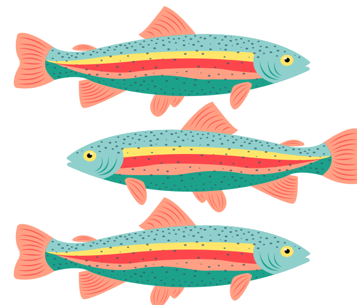
A PARTY OF RAINBOW FISH