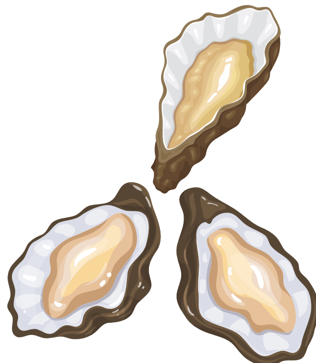
A COLONY OF OYSTERS