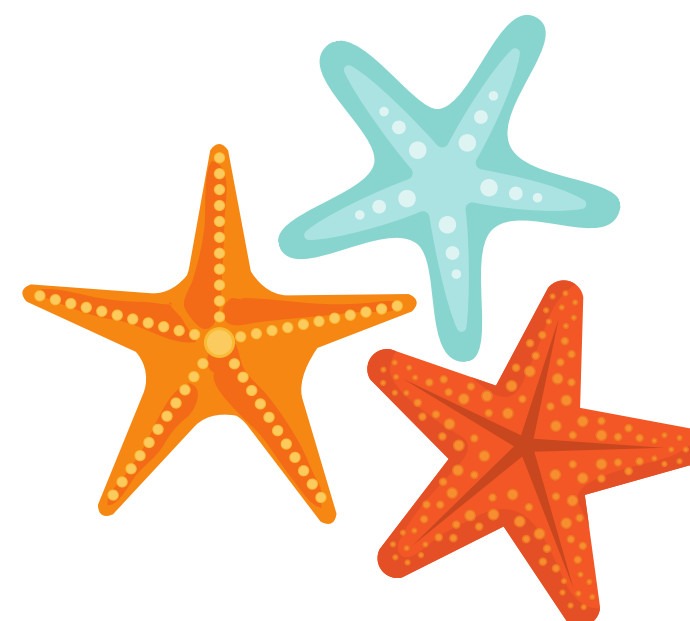
A CONSTELLATION OF STARFISH