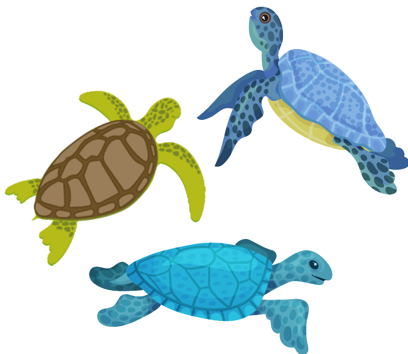
A TURN OF TURTLES