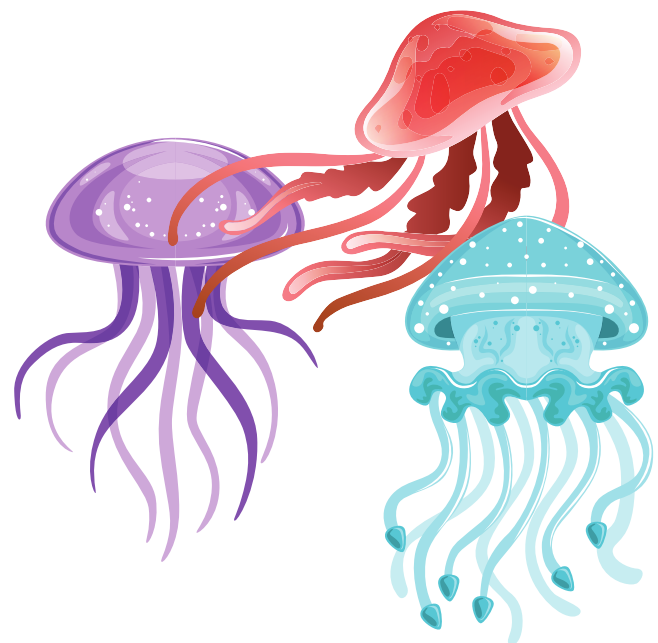
A SMACK OF JELLYFISH