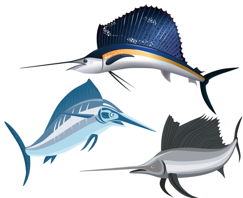
A FLOTILLA OF SWORDFISH