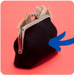
It's a wallet